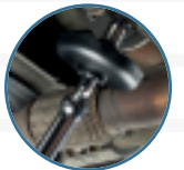
Integrated oil collection tray